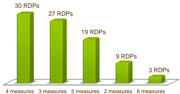
Preserving natural resources measures: number of measures activated in the 88 RDPs

Drawing from the menu of available measures, RDPs generally implemented from 2 to 6 measures together. As shown in the figure on the right, the majority of RDPs implemented 4 (30 RDPs) or 3 (27 RDPs) measures together. Around 20% of the RDPs implemented 5 measures. Few programmes chose to implement only two or all six measures.