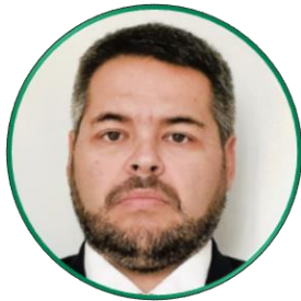
Barna Kovács General Secretary

BIOEAST – Promoting the development of a sustainable bioeconomy in Central and Eastern Europe