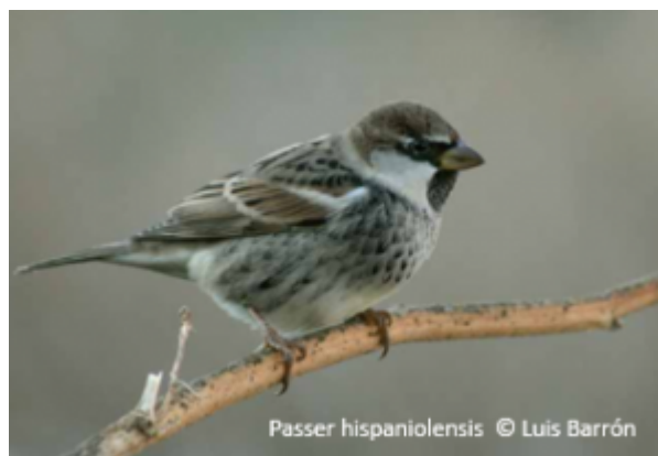
Passer hispaniolensis

Granting a premium to support viticulture on steep slopes and terraced vineyards as a high-quality farming practice