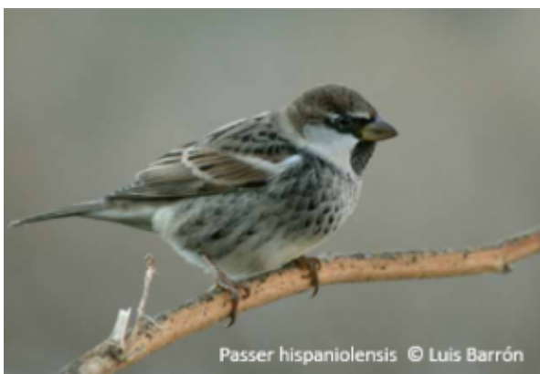
Passer hispaniolensis

Two young farmers set up a hydroponic facility to produce high quality green fodder for livestock in the Canary Islands.