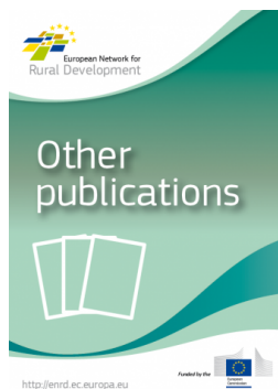
[11] http://enrd.ec.europa.eu Smart Villages and the European Green Deal: making the connections [12]