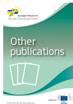
[13] http://enrd.ec.europa.eu Smart villages in Scotland [14]