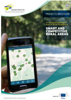
[4] EAFRD Projects Brochure 'Smart and Competitive Rural Areas' [5]