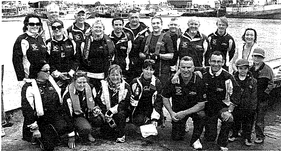
■ Moville Rowing Club members - pictured in Greencastle on Saturday afternoon following their row from Islay in Scotland