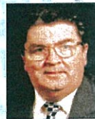
John Hume, Patron