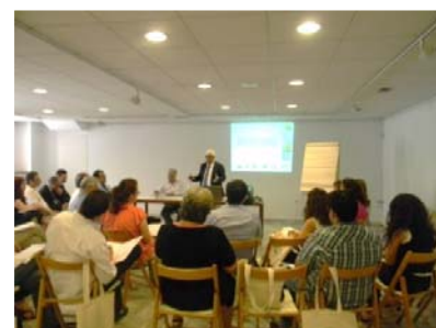
The 1 st Group was preferred by various rural institutions and ministry officials

After the speeches, key speakers raised two main questions that the participants were asked.