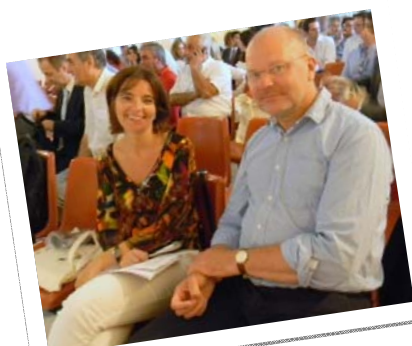
The two representatives of Italian and Swedish Network

The 2 nd Axis of the NRN's Action Plan is dedicated to identifying, analyzing and disseminating information to local and national level relating to transferable relevant practices for rural development.