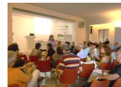
The 3 rd Group attracted most of the participants while the participation of LAG's representatives was very strong