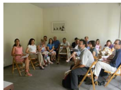
In the 2 nd Group participated mainly representatives of NGOs, Ministry of Environment and LAGs