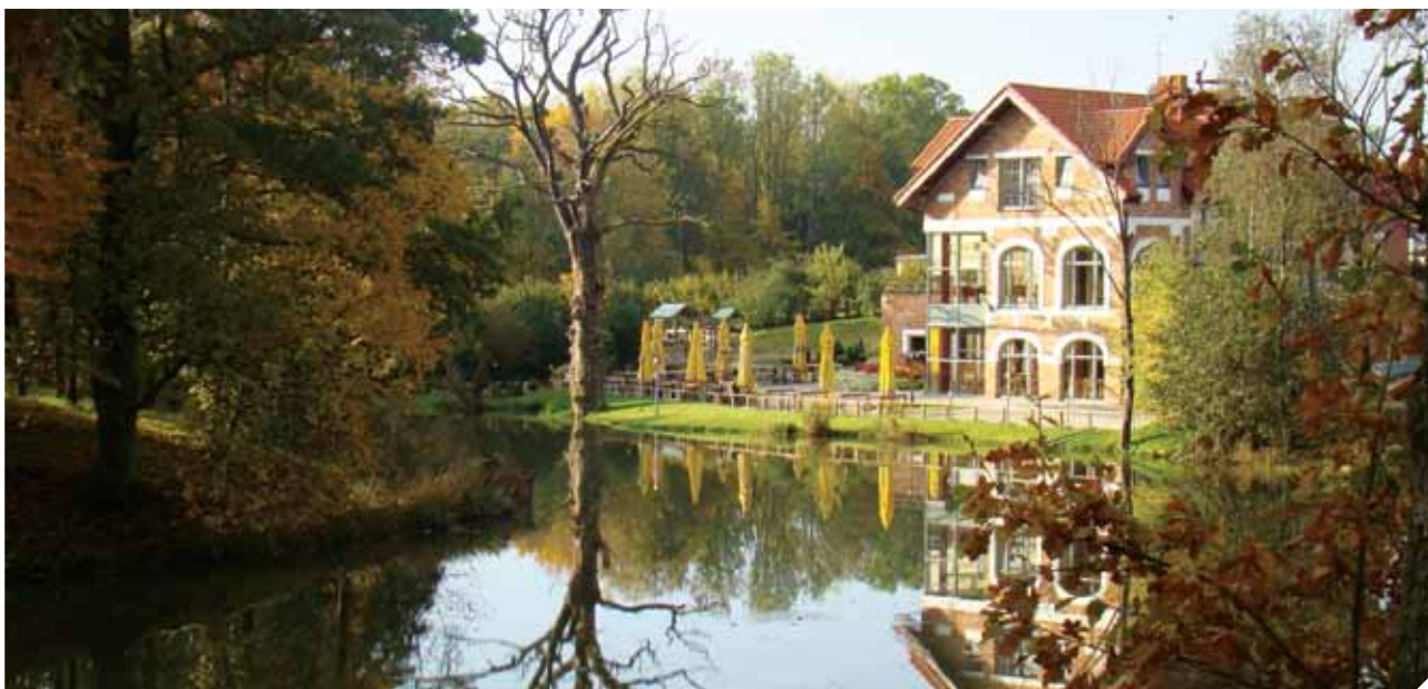
Panorama of rural tourism homestead estate "Radailių dvaras".