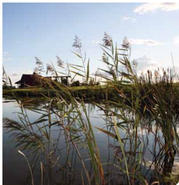
Everybody likes relaxing in the nature.