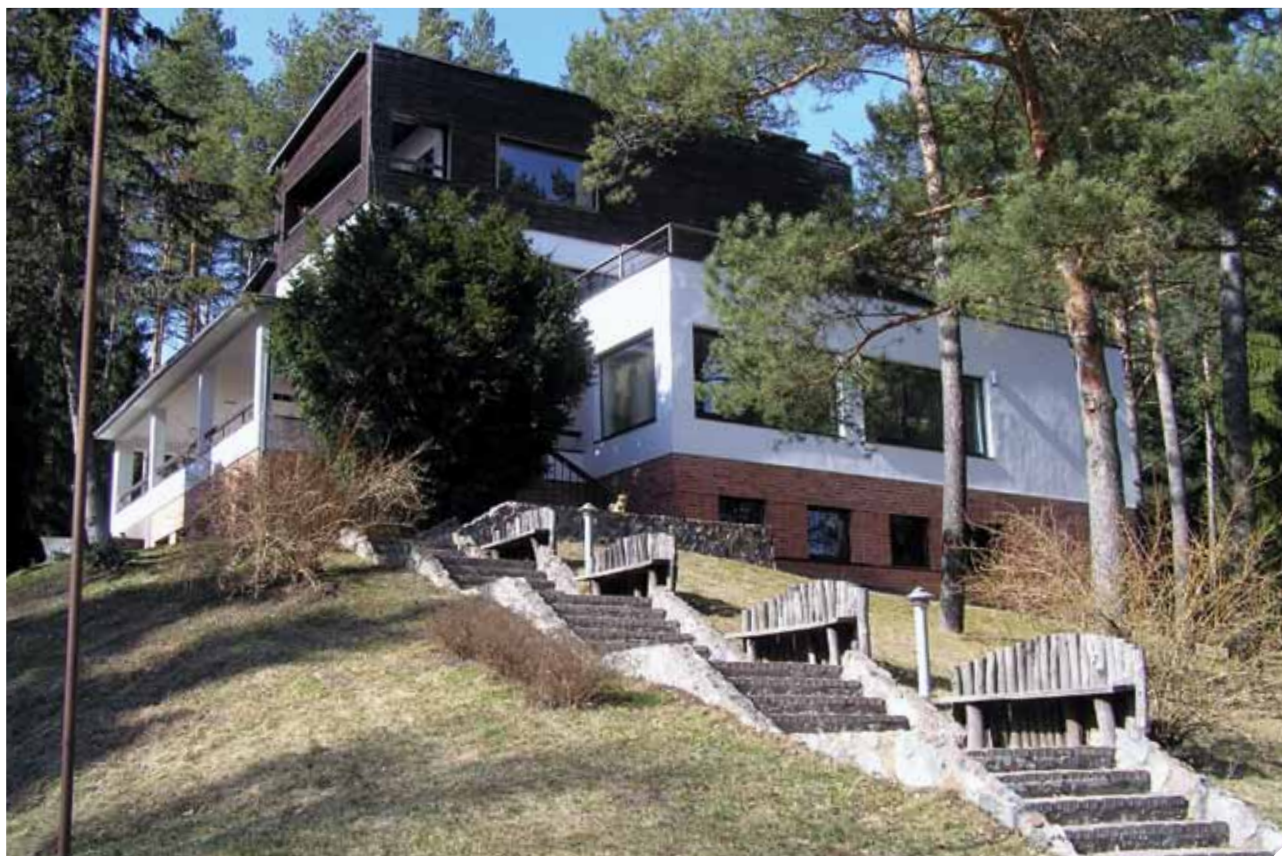
The main building of the farmstead is high on the slope.

though “Kirkšnovė” welcomes all, be they revellers, wedding guests, and holidaymakers searching seclusion in the nature. Here all conditions exist for organizing business meetings, conferences, and seminars. And this is available the whole year round. Guests may go fishing, boating, canoeing, water-cycling, climb hilly trails, fly with a rope like Tarzans over the “precipice”, pass by a “monkey-bridge” connecting two slopes, and balloon. The outdoor swimming-pool and bathhouse with natural outdoor cascades are available. After heating in the bathhouse, you may go and jump under the falling water stream of the pool. You can go skiing in winter and enjoy other winter entertainments. One can play billiards, table-tennis, and shoot a bow. Residential apartments with showers and other amenities are nicely arranged. In the farmstead, tree sap is available for guests all the year round. Each spring about half a ton of sap is being prepared. For it to keep longer, it is pasteurized and stored in containers. If one chooses for his relaxation the period of honey harvesting from a beehive, he, together with the hosts, may participate in this process. All conditions are offered for tent hikers.