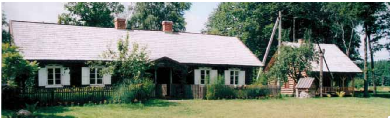
Holidaymakers are captivated by an ancient ethnographic homestead from the late 19th century, with a large forecourt and a garden.