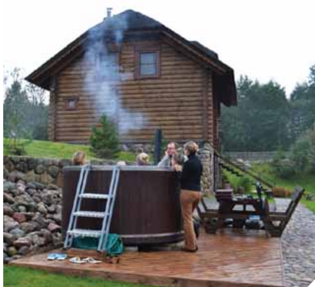
Glimpses of relaxation

"The farmstead needed to be given a name. On a nice morning we went to the yard, looked at the blue sky, then we saw the verdurous hundred-year old linden trees. And decided – here the farmstead "Among the Linden Trees" will be set up. The more so that we brought up two daughters as young linden trees. Is it a coincidence or a fate?" smile the farmstead owners.