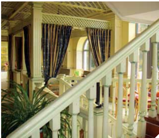
In the reconstructed building.

coast". Vita smiles: they could not build a restaurant on the real seacoast, but nobody hindered them to dig a pond and name it the Radailiai Sea.