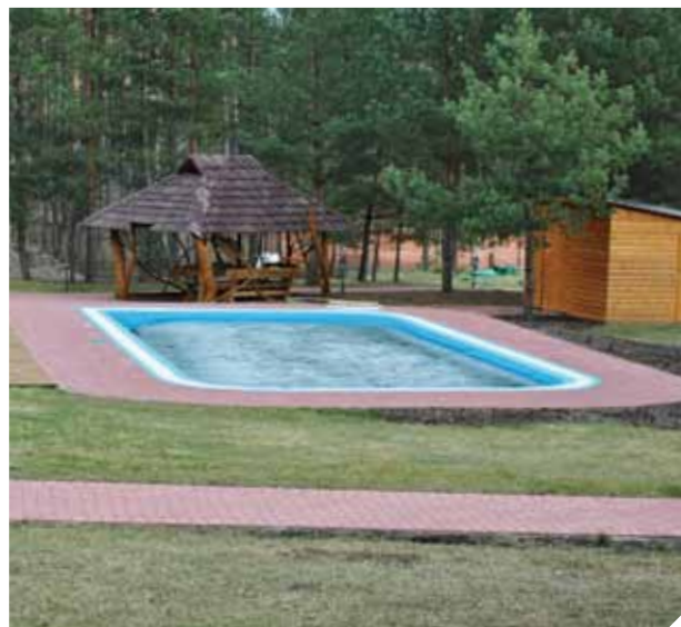
Summer is the most attractive pastime in the farmstead.