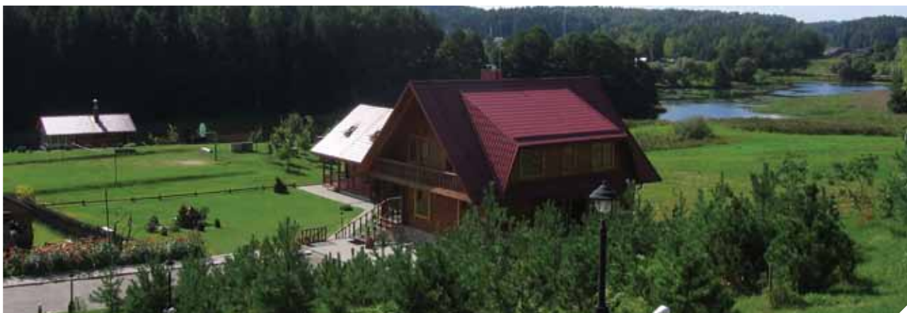
Close to the Bieliniai family rural tourism farmstead is Nava Lake.