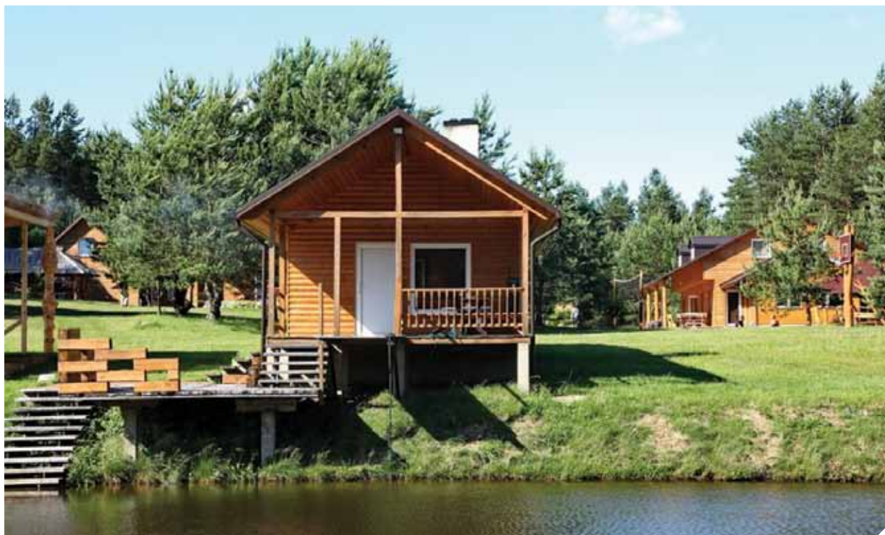
Farmstead "Pearl of Dzūkija".