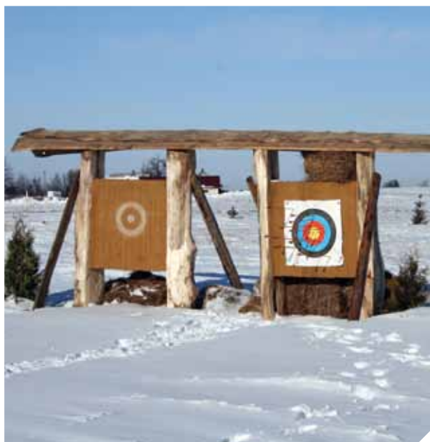
The archery range for shooting bows, reminding weapons used by medieval archers, is arranged.

Summer is the most popular season in the farmstead, even though guests are welcome all the year round. Annually, about 1000 people, on the average, visit the farmstead. For clients, we offer bathhouse services, a tub, night accommodation, banqueting and conference halls, and children’s playgrounds. Fishing and water cycling on the pond are available. The farmstead owners are ready to organize any other possible entertainments to the wishes of their guests. Traditionally, live music festivals “Songs by the Bonfire” are organized. “Bukonys” is the most well-known and most frequented rural tourism farmstead in Marijampolė municipality, which was estimated at a 3-4 stork level. “The vision of owners is a cosy, functional, interesting and well-arranged rural tourism