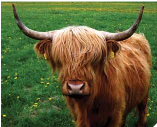
Gediminas Bagdonavičius is breeding Scottish highlanders.

Rural Development and Fisheries priority measure “Promoting the Adaptation and Development of Rural Areas” of the Single Programming Document (SPD) for Lithuania 2004–2006, everything, probably, would end with a perspective from a bird’s eye view. “To start from scratch it would be too difficult, even impossible, when even an electric line was laid only on the other side of the Dubysa. Therefore, not wasting my time I prepared a project “The Rural Tourism Farmstead of Gediminas Bagdonavičius” with the total value of almost 3 million Litass (with VAT). The supported part of the project is 1.2 million Litass”.