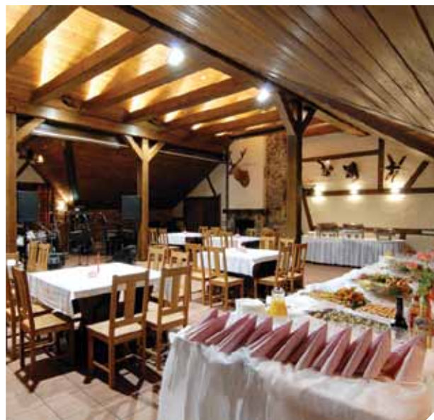
The hall of “Capital of Hunters” may seat 80 participants of the feast.

“Capital of Hunters” very soon justified its eloquent name. In almost a year and a half after the housewarming party, a Lithuanian record was achieved here: the festivity in the 4 ha farmstead territory gathered 2,500 participants, including 650 hunters.