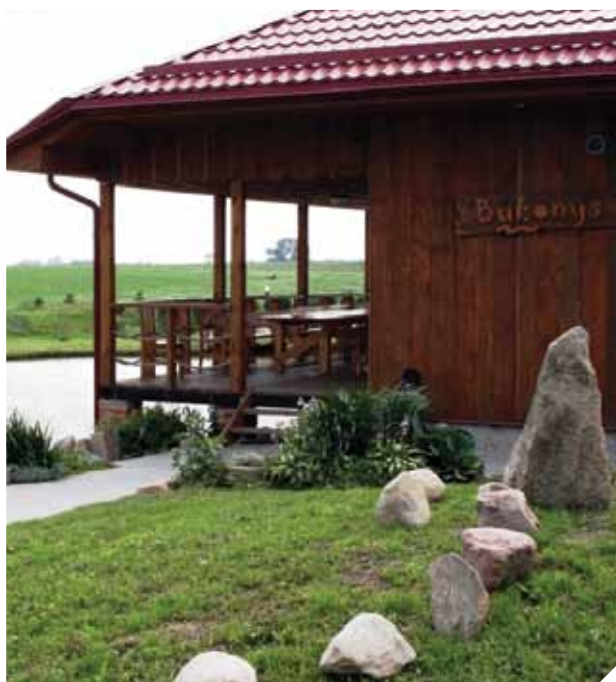
Zenonas Naumavičius' vision is a cosy, functional, interesting and well-appointed rural tourism farmstead, constantly changing, propagating active and healthy pastime the whole year round.

farmstead, constantly changing, propagating the active and healthy relaxation through all the seasons. Here not only accommodation but also catering services are provided. Various cultural and other events are organized in