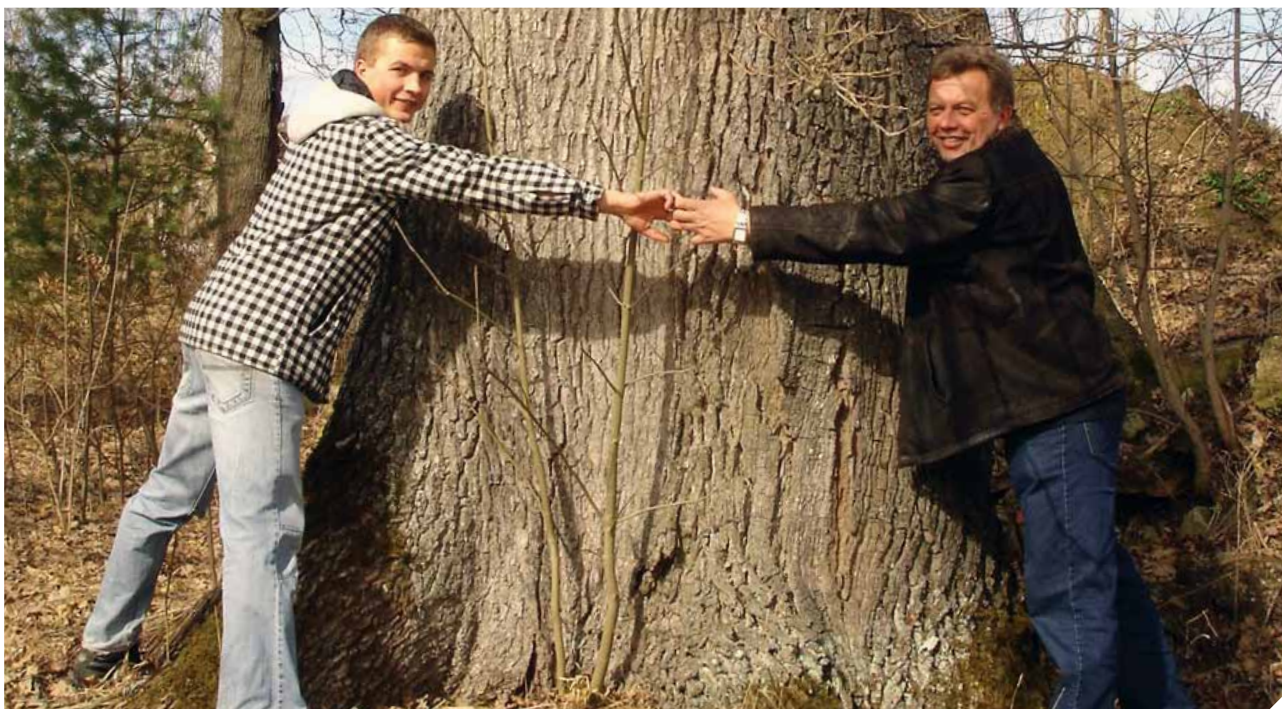
Father and son cannot embrace a hundred-year old oak with their hands without the help of all family members.