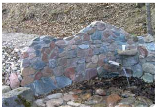
One of the numerous wells in the farmstead.