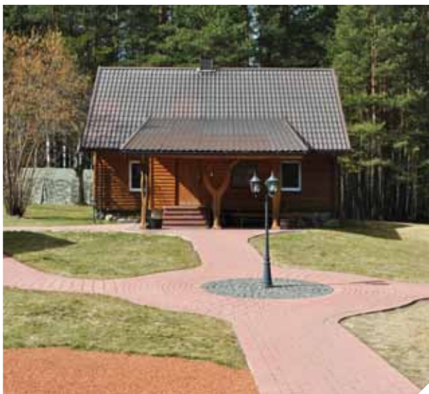
Paths were paved from the EU and national budget support.

At the beginning of 2012, the farmstead owner decided to take the forest by “attack”. Birutė filed an application to the NPA and in 2011 prepared a project “Management and Adaptation for Recreation of Birutė Stepankevičienė’s Forest Plot at Dubaklonis Village” for the support under the measure “Non-profit Investments in Forests” of 2007–2013 Lithuanian Rural Development Programme.” The support of 188,496 Litass was granted to Birutė under this measure. Out of these funds, the farmstead owner plans to build four outdoor arbours, playgrounds, health trails (some 1.7 km), an observation deck for admiring magnificent views, and a car parking site. The future plans include the blueberry plantation. When Birutė speaks about it,