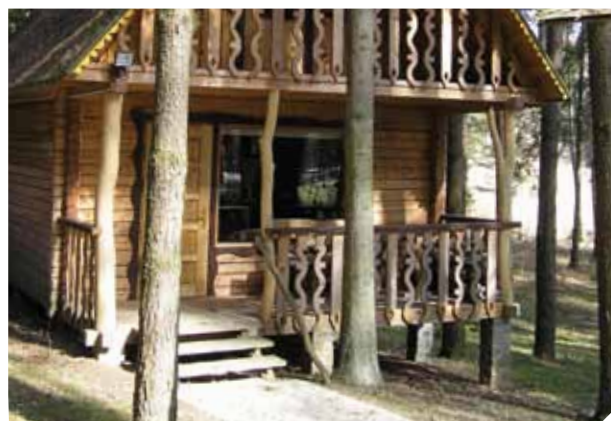
A hut of the newlyweds.