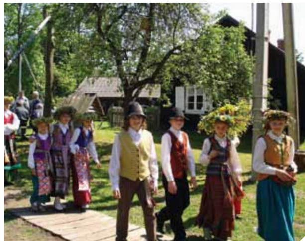
Schoolchildren are sincerely interested in the style of life and traditions of their grandfathers and forefathers.