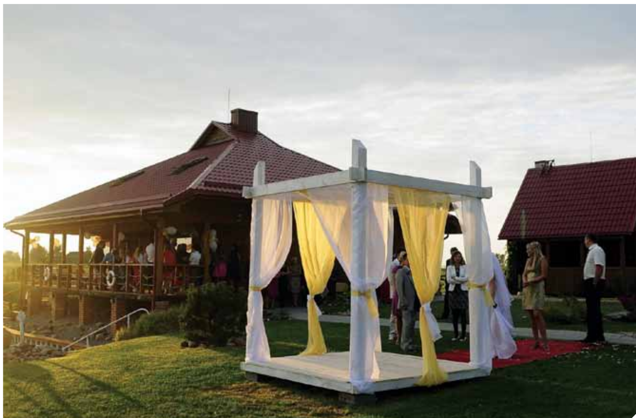
Live music festivals "Songs by the bonfire" are traditionally held in the farmstead.

The archery range for shooting bows, reminding weapons used by medieval archers, is installed in the farmstead. On the loan or in the shade of trees in the farmstead, a tent, camper or car may be parked comfortably. A huge bonfire place is arranged nearby and a festive fire may be made for cooking fish-soup or grilling savoury ribs. The hosts from Suvalkija, being prudent, tidy and hospitable, warn everybody: "You don't need to bring firewood, but it is necessary to be in high spirits and to have good friends!"