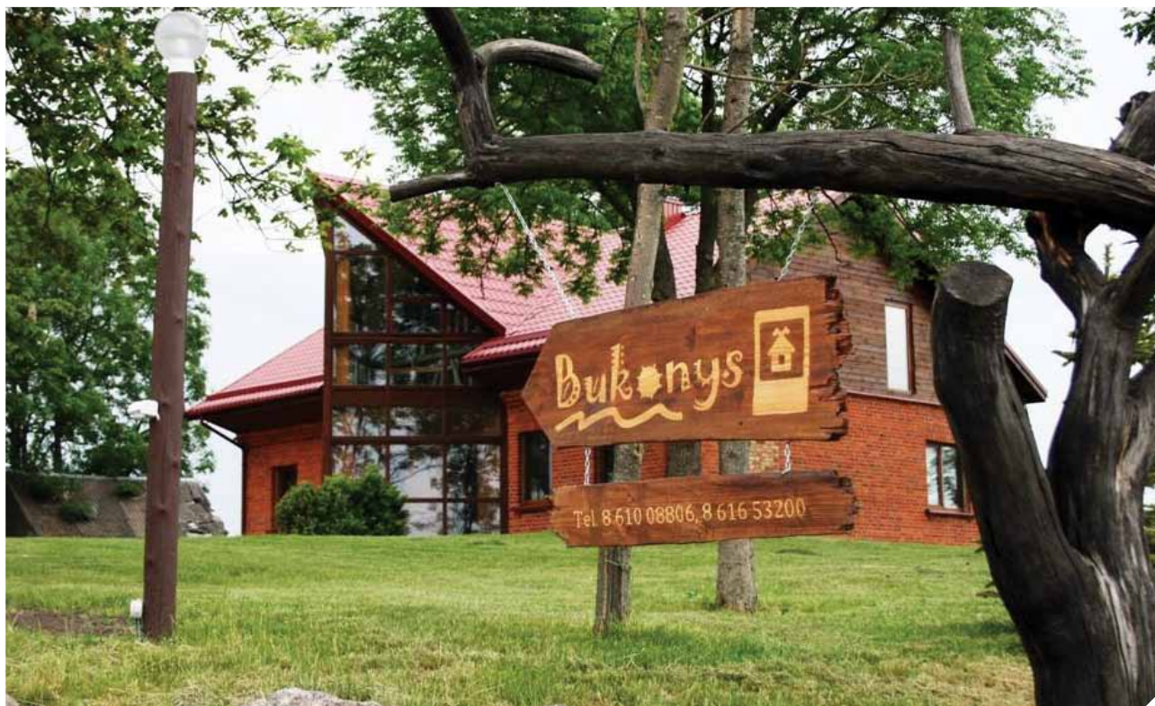
“Bukonys” rural tourism farmstead.