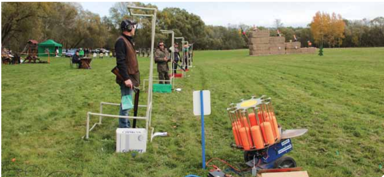
The professional shooting-range, installed with the use of the RDP measure “Encouragement of Rural Tourism Activities”.