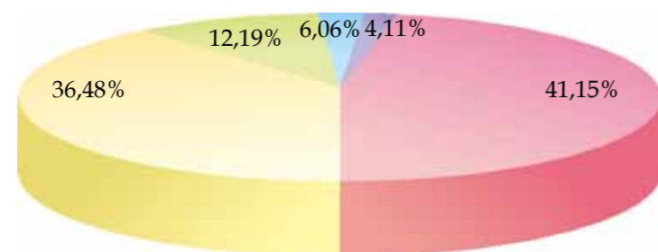
Fig. 4. Allocation of funds in 2007-2013 under RDP