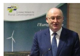
Phil Hogan, European Commissioner for Agriculture and Rural Development

"We will need you – the experts at the coalface of our national and regional economies – to take ownership of the EFSI if it is to succeed".