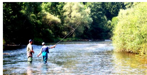
A famous place to fish