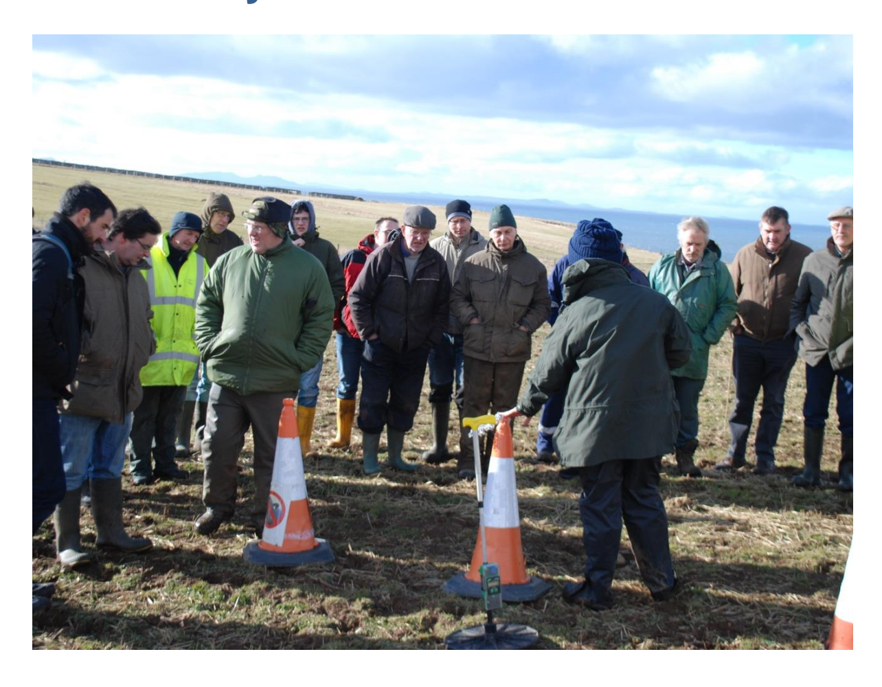
Meetings held outside in the cold