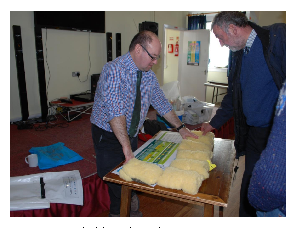
Meetings held inside in the warm learning condition scoring sheep